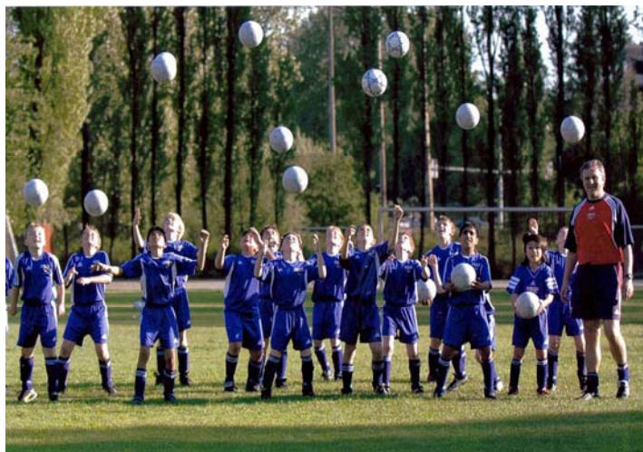
"ABILITY WILL GET YOU THERE, CHARACTER KEEPS YOU THERE."

For dates and locations of upcoming camps please visit out our web site.