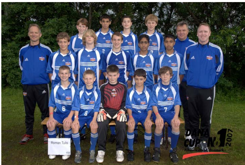
THIS PAST SUMMER, THE TULIS U-13 BOYS BECAME THE FIRST CANADIAN BOYS TEAM EVER TO CAPTURE GOLD AT THE DANA CUP TOURNAMENT IN DENMARK.

During the first week at the Dana Cup in Denmark, the boys dominated play with intelligent and creative football, often maintaining possession for long periods of time. When the ball was lost, the team defended with ferocious tenacity and permitted very few goal scoring opportunities despite the physical aggressiveness of their opponents. They completed the round robin play with a 3-0 record and 8 goals for and none against. The team continued its display of creative foot-